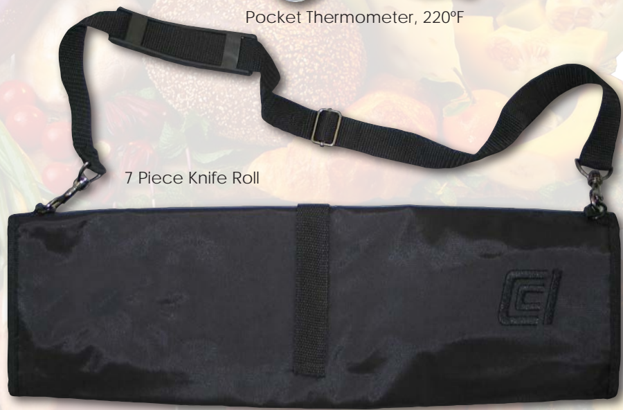
7 Piece Knife Roll

Insist on CCI Superior Culinary Master® knives made exclusively in Europe. Enhancing culinary performance for over 60 years!