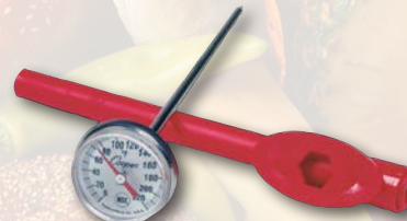
Pocket Thermometer, 220°F