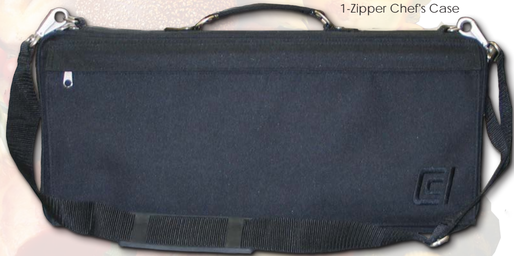
1-Zipper Chef's Case