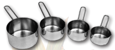
4 Piece Measuring Cup Set