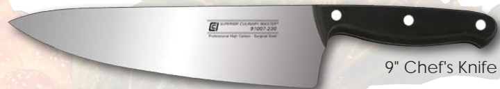
9" Chef's Knife