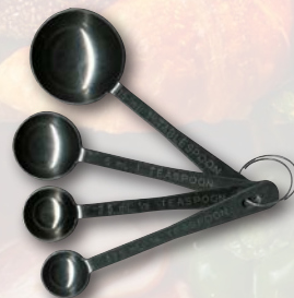
4 Piece Measuring Spoons

The above tools have been selected by your Culinary Instructors.