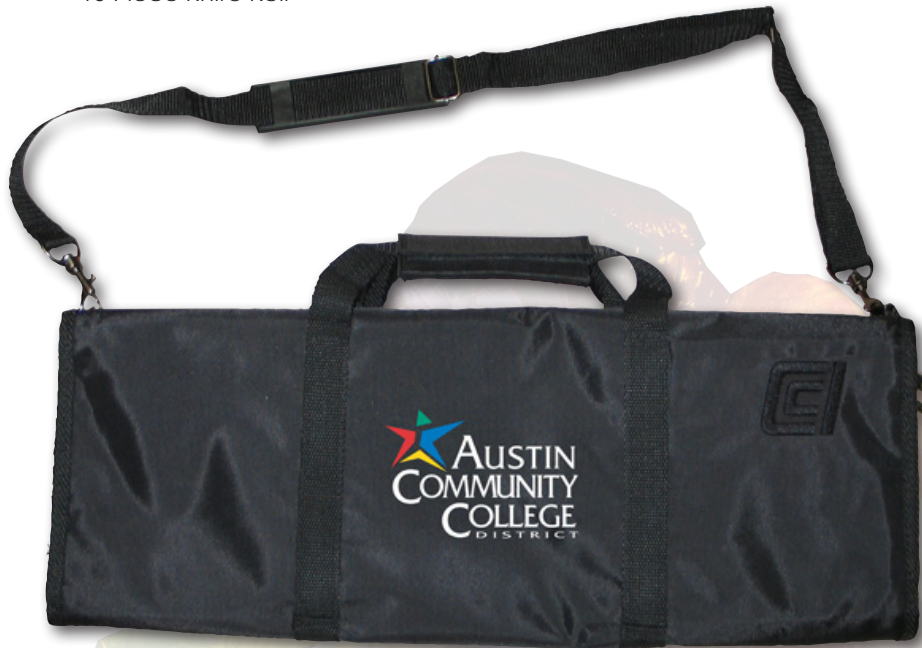
10 Piece Knife Roll